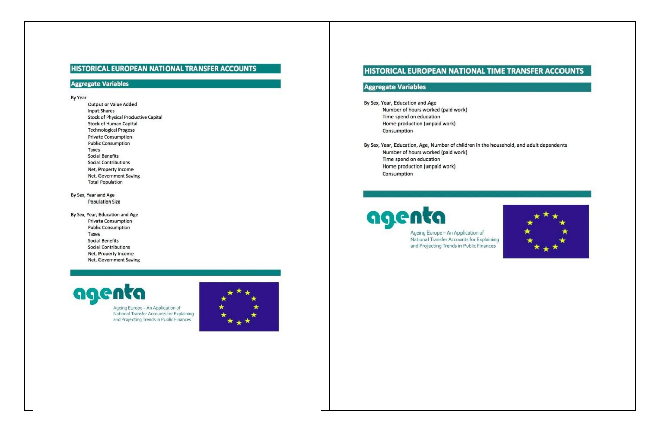
Figure 1: Front page of Variable list NTA (left-hand side) and NTTA (right-hand side)